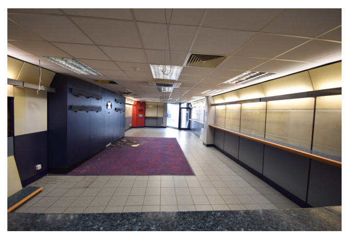
Interior (from rear)