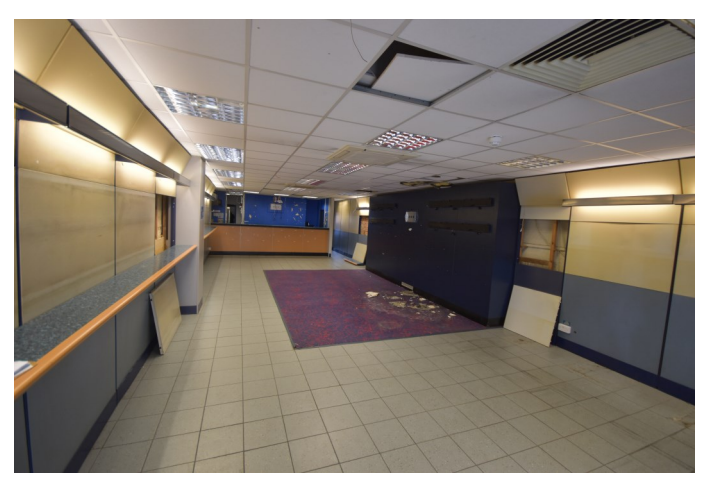
Interior (from front)